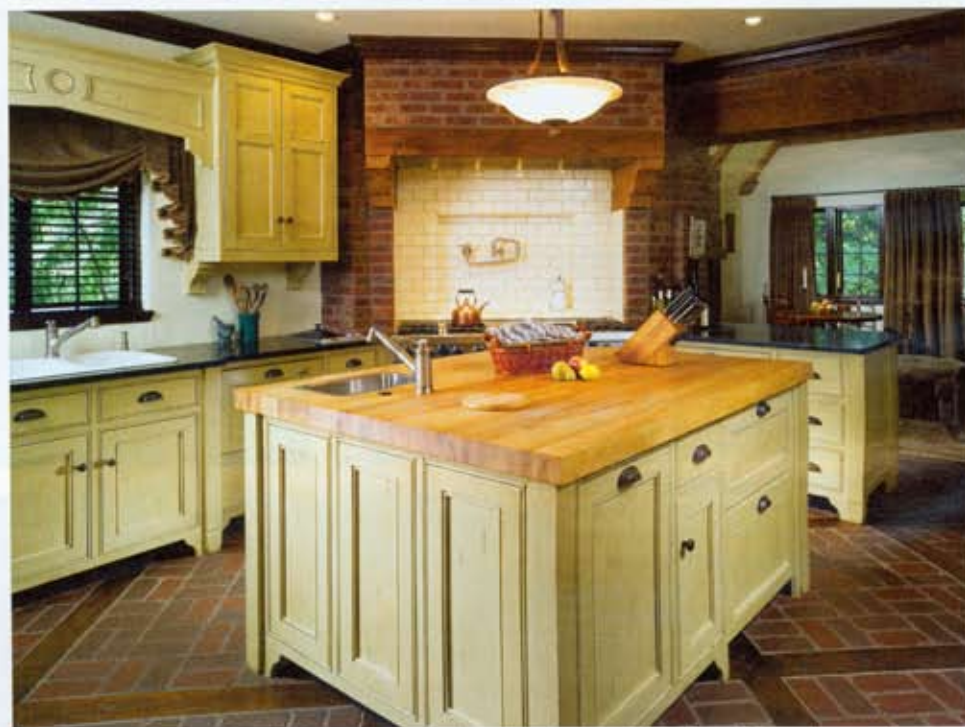
A maple countertop was placed in front of an oven and range to obscure a direct view of the modern appliance upon entry to the kitchen; the stainless-steel hood liner above is concealed with brick and French oak.